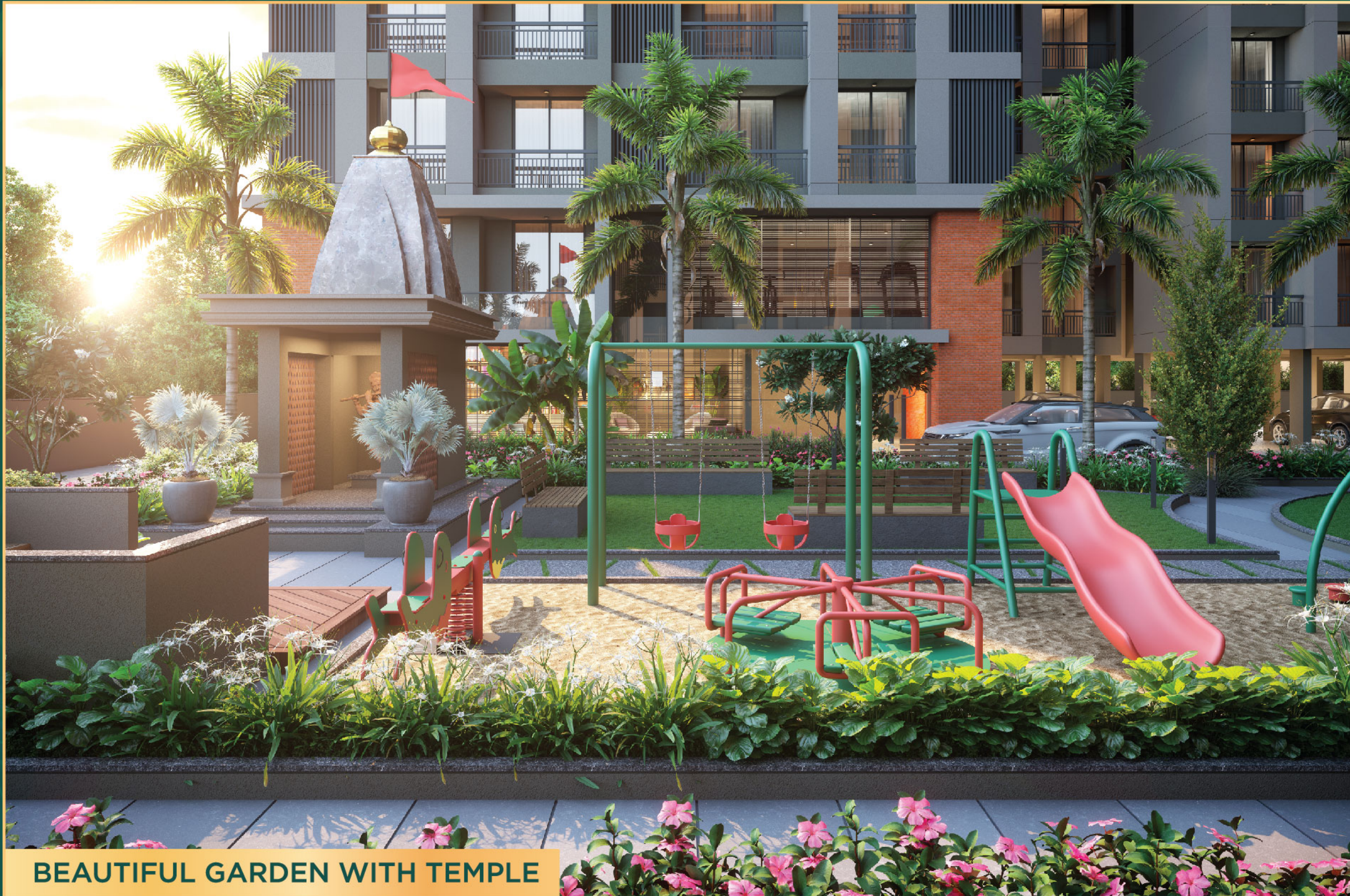
BEAUTIFUL GARDEN WITH TEMPLE