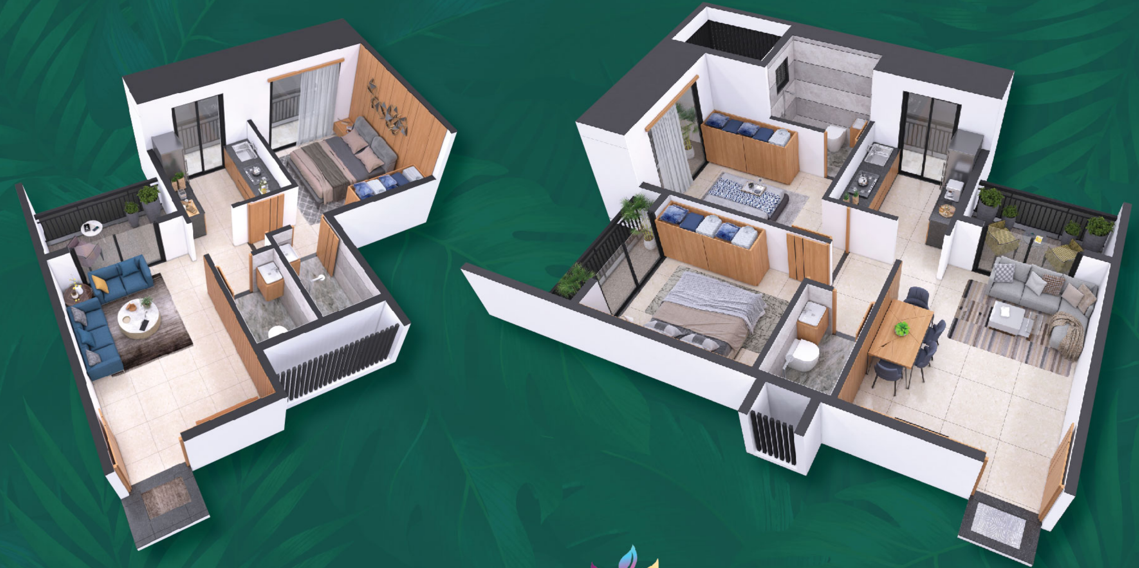
1 BHK TYPE - 1